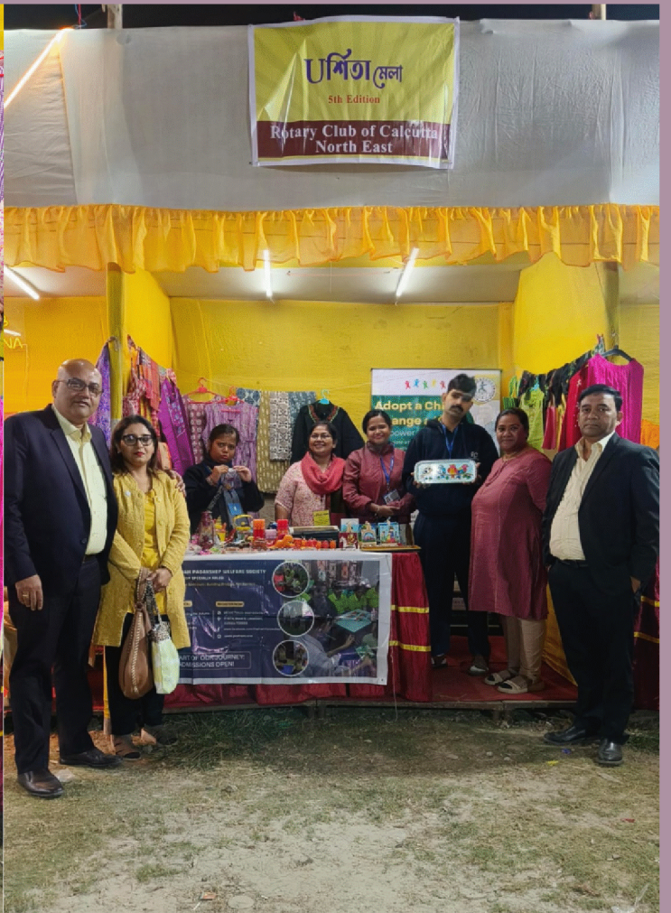
RCCNE sponsored a stall for Pratham Padakshep, an NGO, at Urshita Mela, winter exhibition and sale, held at Simla Byayam Samiti Durga Puja Ground